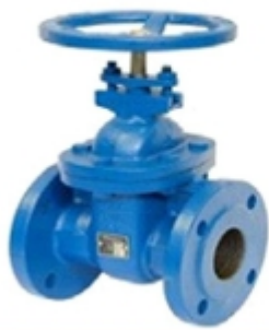
Gate Valve / Sleeve Valve